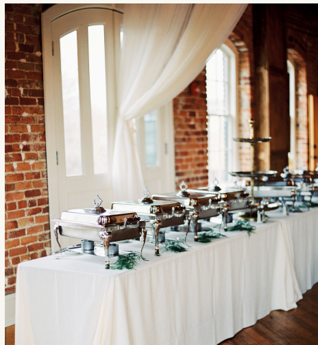
Nancy Ray Photography

Mixed Seasonal Vegetables | a mix of fresh, seasonal vegetables seasoned and sautéed